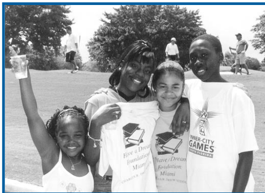
Miami Dreamers at their Annual Golf Classic.