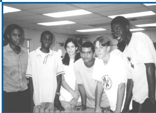
Boynton Beach Dreamers.

Florida Boynton Beach's ninth grade Dreamers hailed their