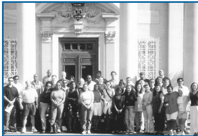
PCs and National Staff convene at the Harrison Center in Glen Cove, New York.

In preparing for the Summer Institute, staff at National created a set of materials for Project Coordinators to use at the training session and continue to use throughout the year. These materials will be sent to all Project Coordinators so that they can keep themselves up to date. In January, the training will reconvene at Harrison for Phase III: Winter Institute ,