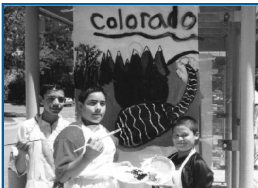
Boulder Dreamers painting a local bus shelter.

California East Palo Alto's Class of 2000 has graduated. Thirty-four of the original 38 Dreamers (adopted in the fourth grade in 1991) are heading off to colleges and universities, including Stanford, UC-Berkeley, and UCLA. Two more Dreamers are scheduled to graduate from high school in December 2000. Next year, a second group of Dreamers will be high school seniors, and they have already begun researching the college application process. Congratulations "I Have a Dream"®—East Palo Alto!